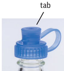
Blue AdaptaCap™ Bottle Adapter