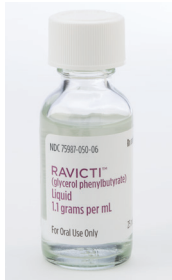
Bottle of RAVICTI